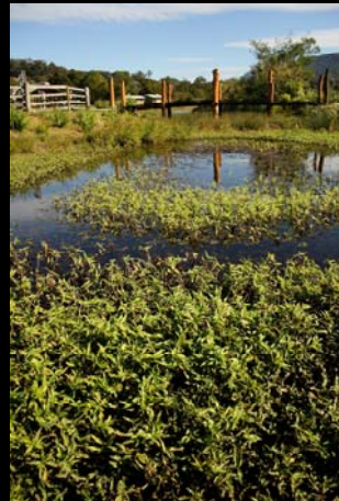
Friendly Ponds Too