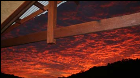
Sunset from 222