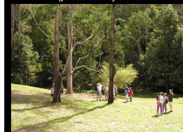
Beauty abounds with mature tree species