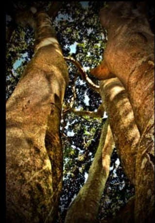
Trees as Friends