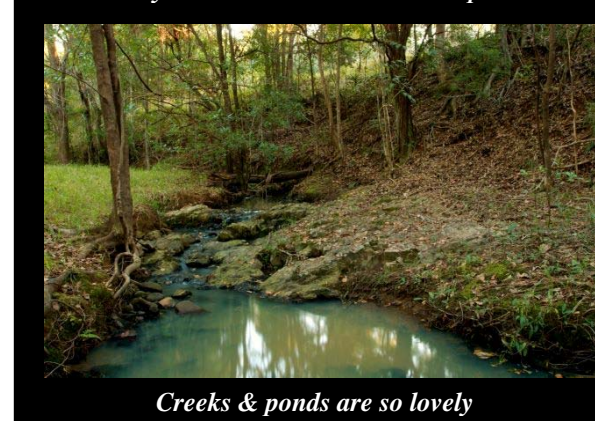
Creeks & ponds are so lovely